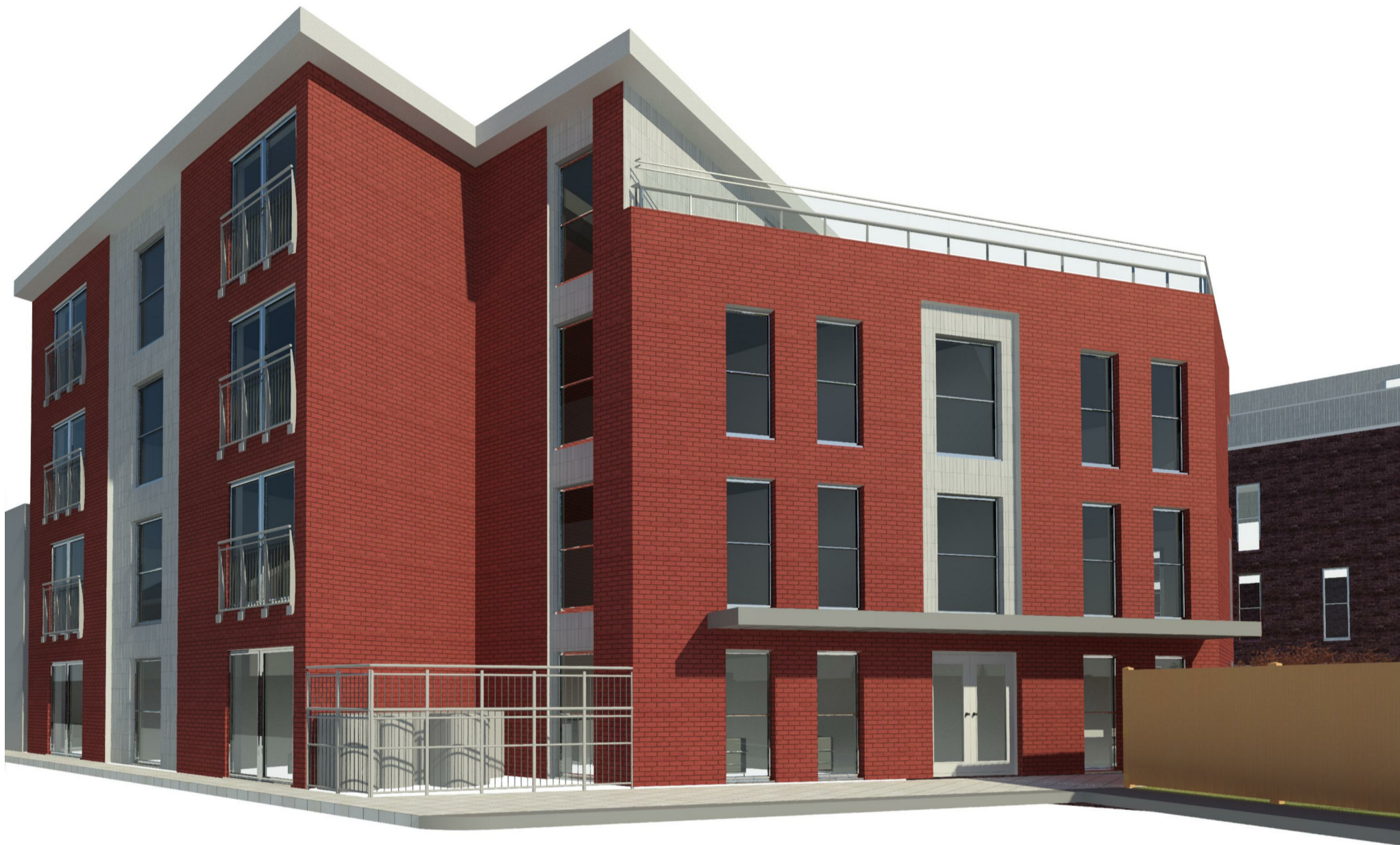
7 3D View -3_14 1 : 1