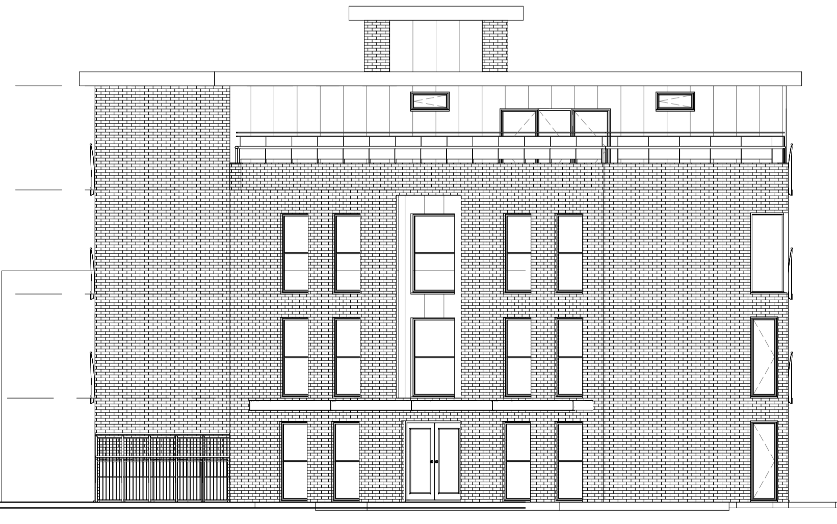
4 West Elevation 1 : 100