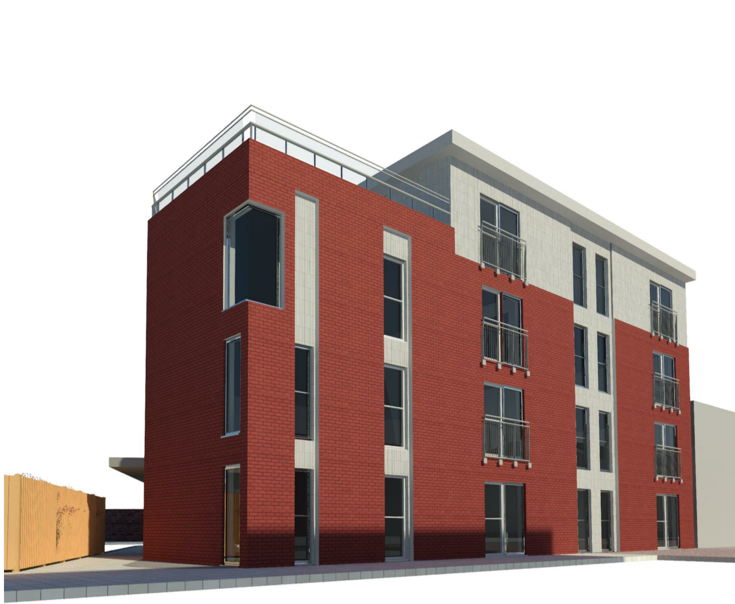
3 3D View 2_17 1 : 1