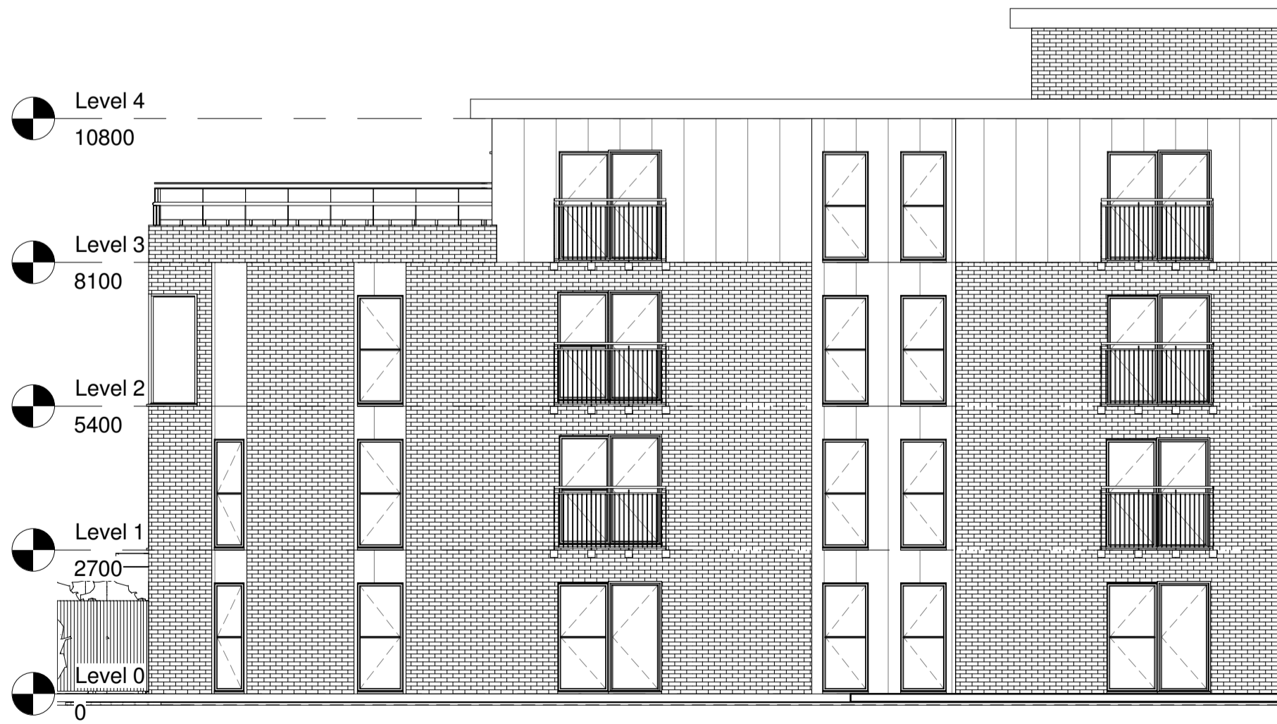
1 South Elevation 1 : 100