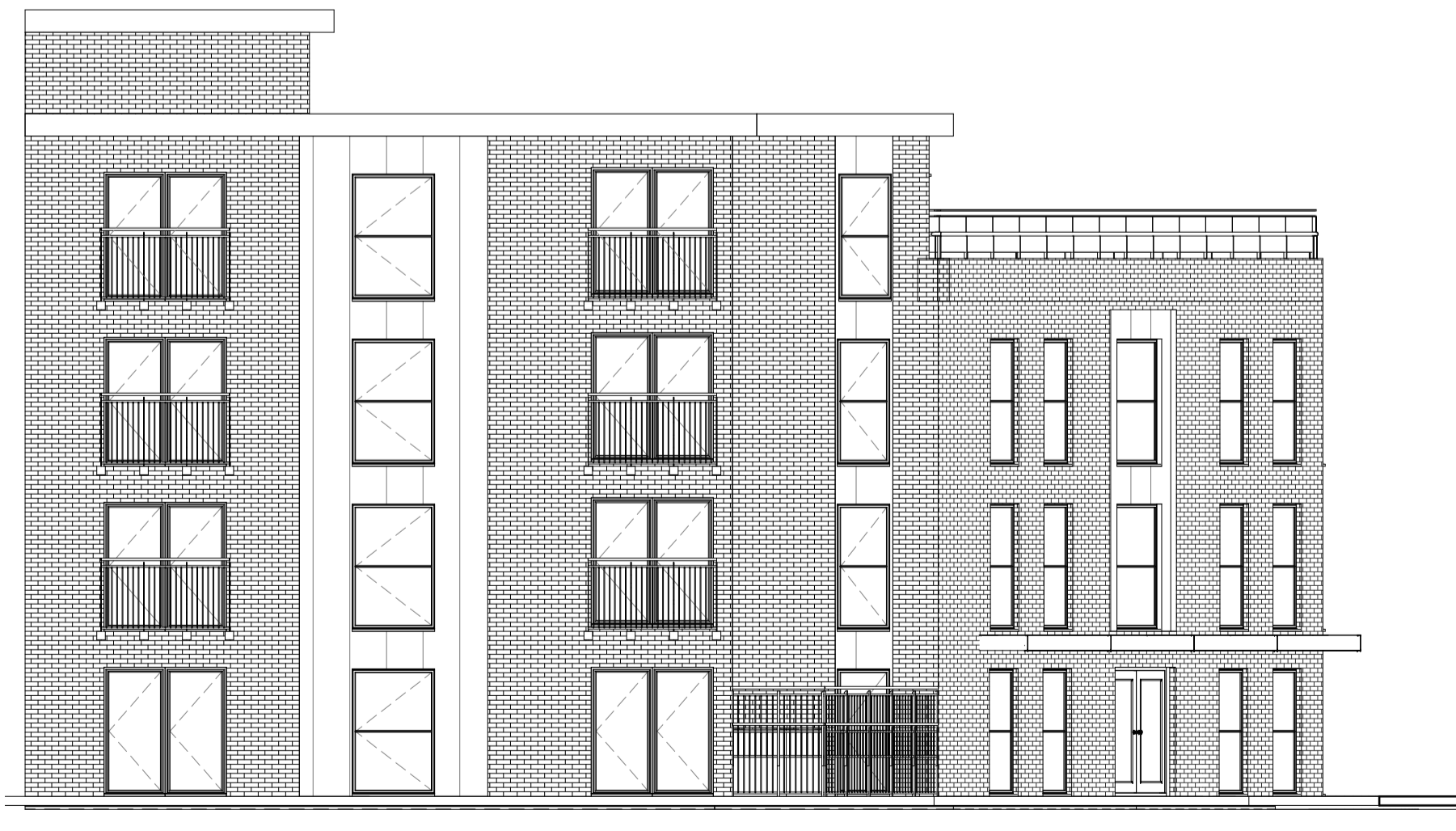
5 North Elevation 1 : 100